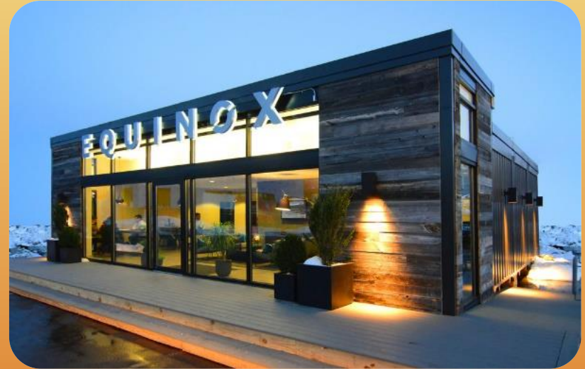
Renovated Shipping Containers