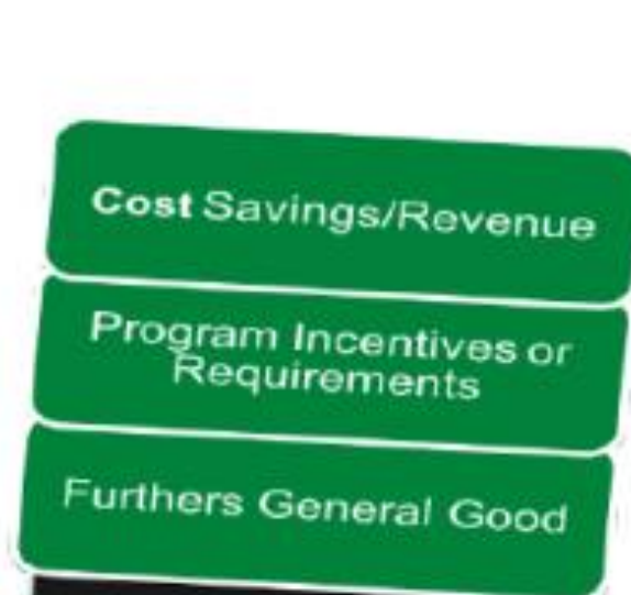
Figure 2. Cumulative Transaction Costs Outweigh Benefits of Vehicle Sharing