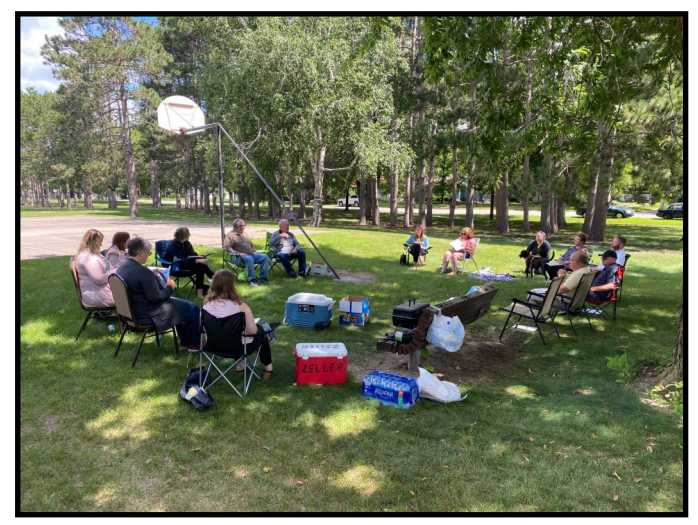
Photo: An ECRDC Administrators City/County Clerks, & Economic Development Professionals Meetings.

The ECRDC organizes City / County Clerks / Administrator & Community / Economic Developers meetings approximately quarterly to discuss mutual key issues occurring in the Region 7E communities. These meetings are held in both online and in-person formats. Past topics include financing opportunities for local units of government and businesses, customized training and workforce needs, business recruitment and expansion initiatives, entrepreneurship, and regional marketing initiatives. These meetings have evolved into a best practices approach to city economic development. Issues and speakers are selected that provide insight that will assist local governments and communities.