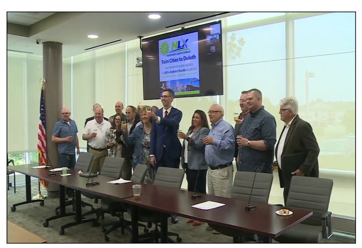
Photo: Northern Lights Express (NLX) Passenger Rail Alliance meeting in Pine City

Northern Lights Express (NLX) Passenger Rail Alliance meeting in Pine City where they discussed (and celebrated) the Minnesota Legislature's approval of $194.7 million in funding for the new high speed passenger rail project. This amount represents 20 percent of total cost but will unlock an additional 80% in federal funding. The existing BNSF railroad will be utilized with the purchase of some newly needed train cars. Four daily round trips are expected with tickets for a one-way trip costing approximately $35. Construction on this project, which includes building a new and remodeling an existing building for station stops in Hinckley and Cambridge (respectively) and improving the existing rail, is expected to begin in about a year. Complete estimates are four to five years.