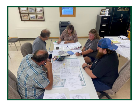
Photo: Mission Creek Township's Planning Commission works on their plan.

The East Central Regional Development Commission is in the process of assisting Mission Creek Township (Pine County) with updating their land use ordinances. We've also worked with several other local units of government to provide technical assistance on a variety of other planning and development projects.