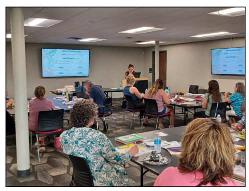
Photo above: Child care providers were invited to a focus group and discussion designed to collect information regarding current barriers and challenges and to generate ideas that can support local providers.

Tactics being utilized by these teams include community open houses/ resource fairs, grant applications, new business marketing efforts, free provider training opportunities, early childhood education tuition reimbursement, and planning with cities, counties, non-profits, businesses, architects.