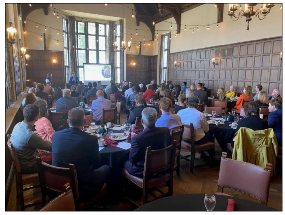
Photo: Northspan's Non Traditional Lender Forum on June 7th in Duluth.