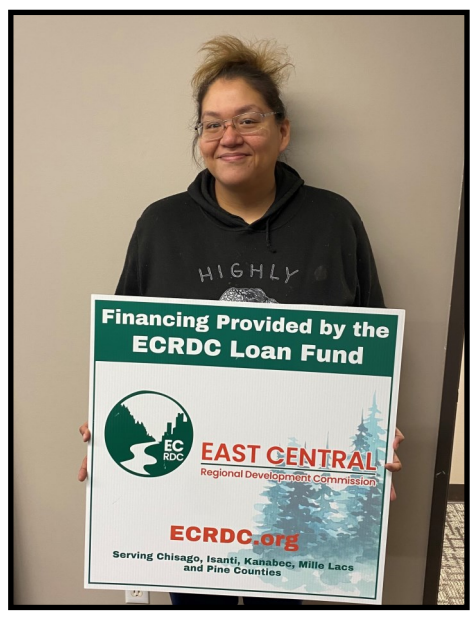
Photo: The ECRDC Revolving Loan Fund (RLF) can provide financing for new, expanding or relocating businesses in Region 7E.